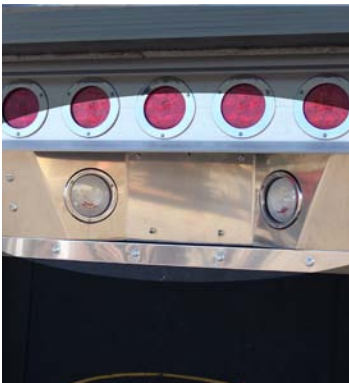
Miller Style Rear Closure With LED Lights