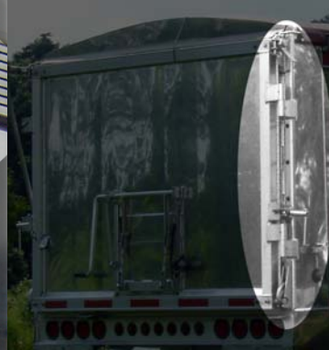
Standard Side Swing