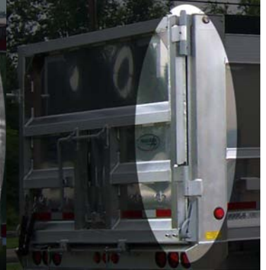
Overslung Side Swing